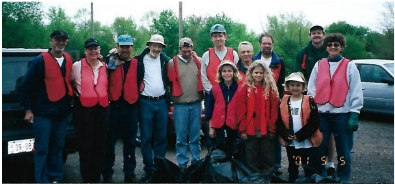
LCUUC's First Highway Clean Up in 2001 – How many people do you recognize?

We are entering our 25th year as a participant in Waukesha County's "Adopt A Highway" program, in which organizations partner with the County to clean up County highway roadsides 3 times a year. Our section is Highway E north from Highway K to EF, where the road turns west. Here is a picture from our first cleanup in 2001 when we were renting the Presbyterian church in Wales. Our section of highway then was east of Hartland, where we met at "Slugger's Bar".