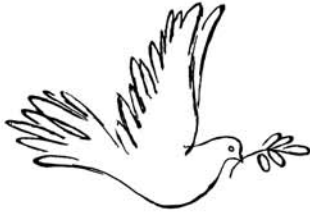
EXHIBIT OPEN 2 – 5:30 p.m.

Unitarian Universalist Church West 13001 W. North Ave. Brookfield, WI